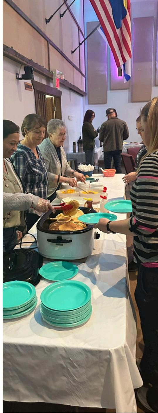
Easter Pancake Breakfast